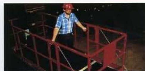
42 inch fold-out extending platform with interlocking slide-out assembly (300 lb. capacity).