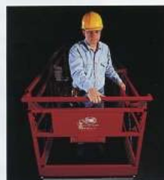
Fold-down guard rails. (Decreases overall height to 78.5 inches.)